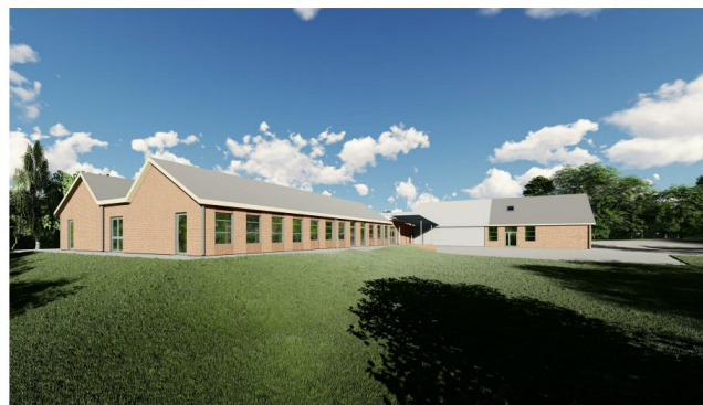
View of Classroom Extension from Playing Field (Southwest)